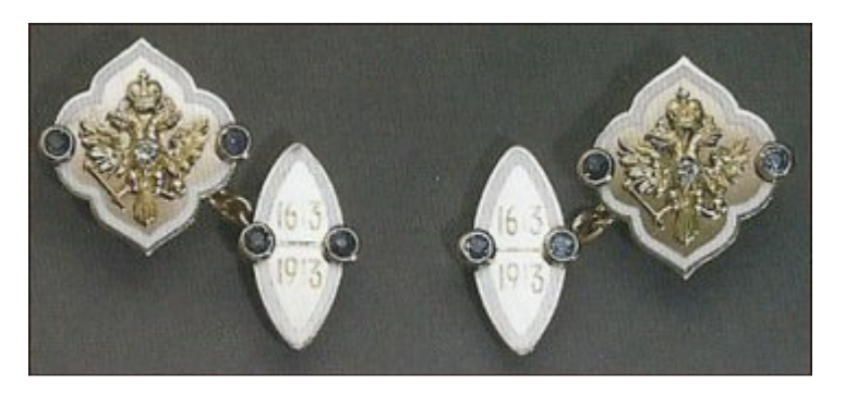
Tercentenary Cufflinks (Christie's New York, Russian Works of Art , October 17, 1996, Lot 99, $18,400)

Pair of gold and white enamel cufflinks, each with a diamond-set, double-headed eagle flanked by two sapphires. The lozenge-shaped end bar of each cufflink is comprised of the dates 1613 and 1913 , flanked by two sapphires. (Christie's New York, Russian Works of Art , October 17, 1996, Lot 99, $18,400)