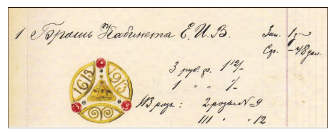
Holmström Design Sketch - May 22, 1913 Matching Brooch Not Yet Found. (Snowman, Lost and Found, 1993, 136-7)

The rubies and rose diamond design sketch shown below (dated May 22, 1913) matches the golden/blue brooches in design (dated February 24, 1913). Both dates fall within the two official celebration time periods (February 21-24 in St. Petersburg) and (May 15-27, 1913 throughout all of Russia) suggesting a continuation of the design and production phase incorporating the Romanov Tercentenary theme after the official events had ended.