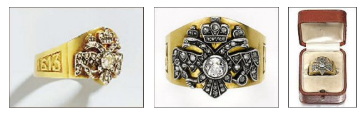
Tercentenary Rings (Christie's New York #4180; Bonham's London, Russian Sale , November 26, 2007, Lot 227; Sotheby's London, #4177)

The three rings identified in auction catalogs all share the same design and workmaster, Alfred Thielemann. Each ring's central feature is a diamond-set, double-headed eagle, the dates 1613 and 1913 on the two sides. Two of the rings have inventory numbers - 4180 (Christie's New York, Russian Works of Art , April 11, 2003, Lot 126, $50,190) and 4177 (Sotheby's London, Russian Art , May 29-30, 2012, Lot 402, £21,250).