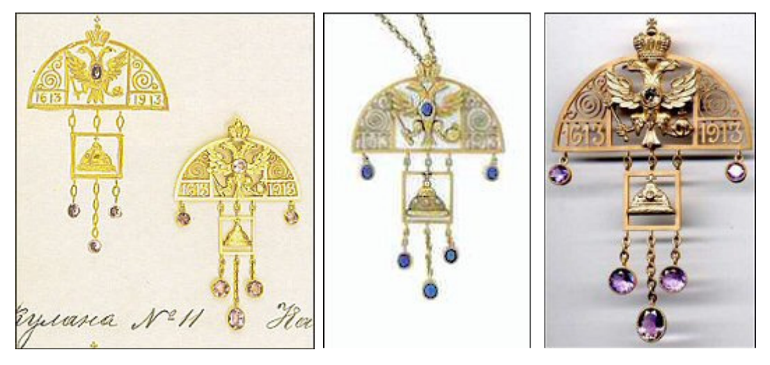
Pendants in Holmström Design Sketch and Examples

From the Alfred Thielemann workshop a two-colored gold pendant in the form of a jeweled cap of Monomakh with three suspended purpurine eggs with diamond-set mounts (without the dates) is in the Woolf Family Collection. Pink gold was used to simulate the mink border of the crown. Although lacking the 1613-1913 dates, the pendant bears the 1908-1917 Russian hallmark, and was probably made for the Romanov 300<sup>th</sup> Anniversary.