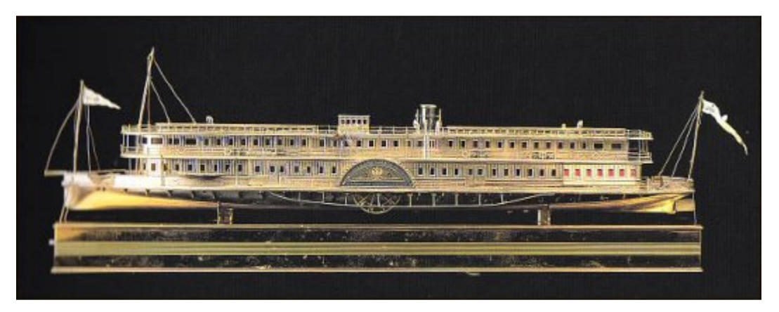
Tsesarevich Alexei Paddle Steamer (Forbes and Tromeur-Brenner, Fabergé: The Forbes Collection , 1999, 251)

The egg's interior contains a rotating, steel globe covered with dark blue enamel and gold representing maps of the Russian Empire in 1613 and 1913 . Seized during the Russian Revolution, it was never sold to the West, and is in the collection of Moscow's Kremlin Armoury Museum.