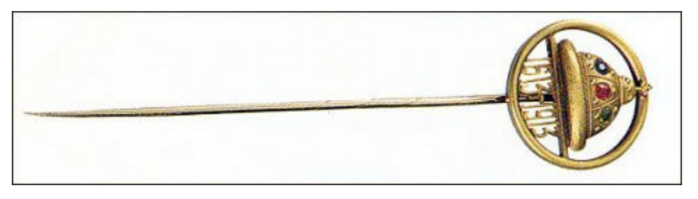
Tercentenary Tie Pin (von Habsburg, Fabergé: Imperial Craftsman and His World, 2000, 260, Item 650)

Cigarette Cases were a popular object from the House of Fabergé, since smoking was a fashionable pastime during the Romanov era. The two cases from August Hollming's workshop illustrated below present a conundrum - not yet solved - in this study. A silver gilt, steel blue-gray guilloché enameled cigarette case, the cover applied with a jeweled cap of Monomakh, and a strawberry-red guilloché case applied with a gem-set cap of Monomakh in an original leather presentation box presented to the Head of the Forests of Poland by Nicholas II during the Tercentenary. Are they Tercentenary gifts?