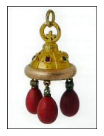
Thielemann Pendant (Wartski, Carl Fabergé: A Private Collection, 2012, 168, Item 142)

From the Alfred Thielemann workshop a two-colored gold pendant in the form of a jeweled cap of Monomakh with three suspended purpurine eggs with diamond-set mounts (without the dates) is in the Woolf Family Collection. Pink gold was used to simulate the mink border of the crown. Although lacking the 1613-1913 dates, the pendant bears the 1908-1917 Russian hallmark, and was probably made for the Romanov 300<sup>th</sup> Anniversary.