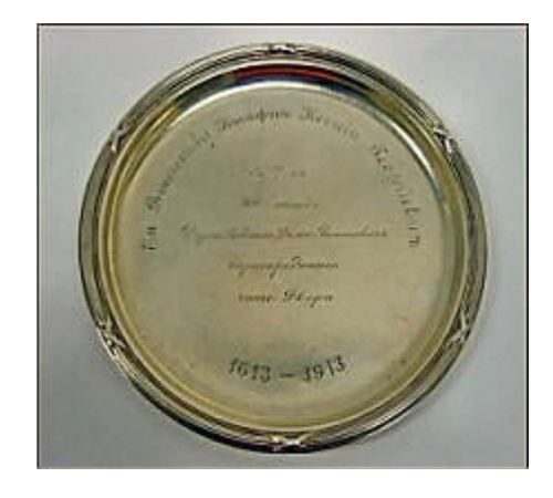
Ksenia Georgievna Romanov Plate

Grand Duchess Marie Georgievna also had a second daughter, Princess Nina (1901-1974), so the possibility exists a Tercentenary plate was gifted to her as well.