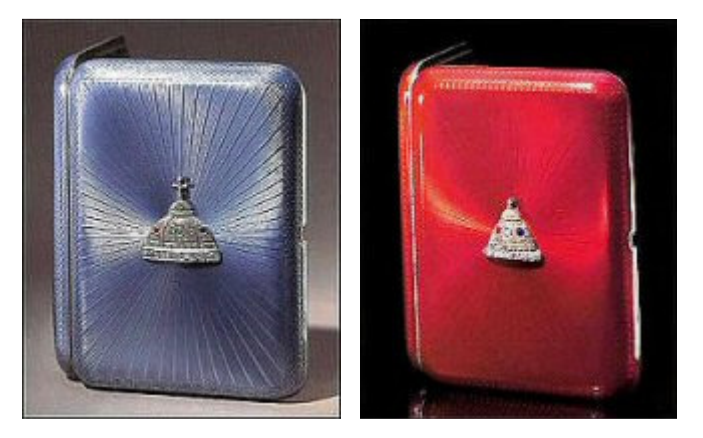
Cigarette Cases with the Monomakh Crown (Traina, The Fabergé Case , 1998, 57, 61)

Cigarette Cases were a popular object from the House of Fabergé, since smoking was a fashionable pastime during the Romanov era. The two cases from August Hollming's workshop illustrated below present a conundrum - not yet solved - in this study. A silver gilt, steel blue-gray guilloché enameled cigarette case, the cover applied with a jeweled cap of Monomakh, and a strawberry-red guilloché case applied with a gem-set cap of Monomakh in an original leather presentation box presented to the Head of the Forests of Poland by Nicholas II during the Tercentenary. Are they Tercentenary gifts?