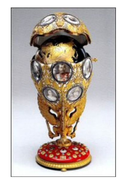
1913 Imperial Romanov Tercentenary Egg (Muntian, Fabergé Easter Presents , 2003, 60)

The egg is an incredible testament to the longevity of the Romanov dynasty, decorated with Vasilii Zuiev's watercolor portraits of all 18 rulers. The gold, silver, and white enameled egg is accentuated with symbols of autocratic power such as the Imperial crown, double-headed eagles, and the cap of Monomakh, and is supported by a three-sided imperial eagle on a gold, enamel and purpurine base.