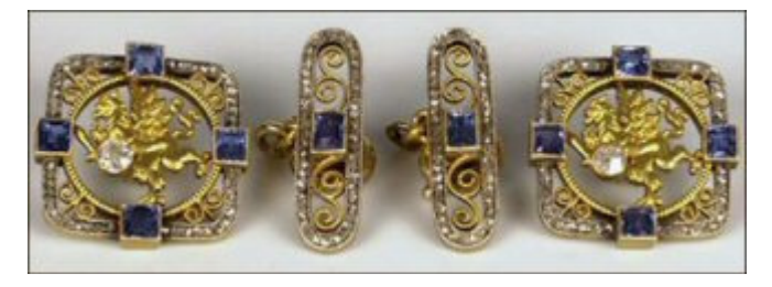
Romanov Griffin Cufflinks (Wartski, Fabergé and the Russian Jewellers, 2006, 47 and 52.)

Pair of gold and white enamel cufflinks, each with a diamond-set, double-headed eagle flanked by two sapphires. The lozenge-shaped end bar of each cufflink is comprised of the dates 1613 and 1913 , flanked by two sapphires. (Christie's New York, Russian Works of Art , October 17, 1996, Lot 99, $18,400)