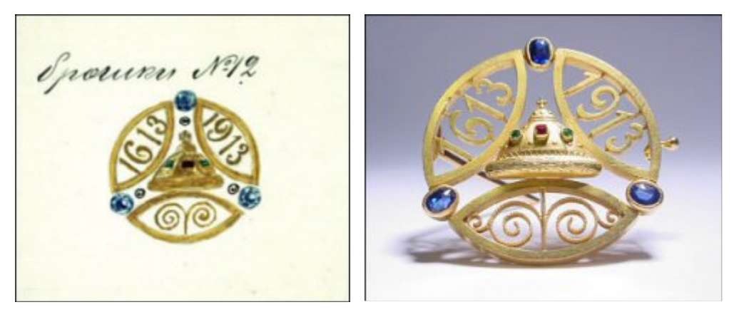
Holmström Design Sketch (February 24, 1913) and Sapphire Tercentenary Brooch #4594

Finding and matching design sketches with the actual objects has been one of the rewards of this review.