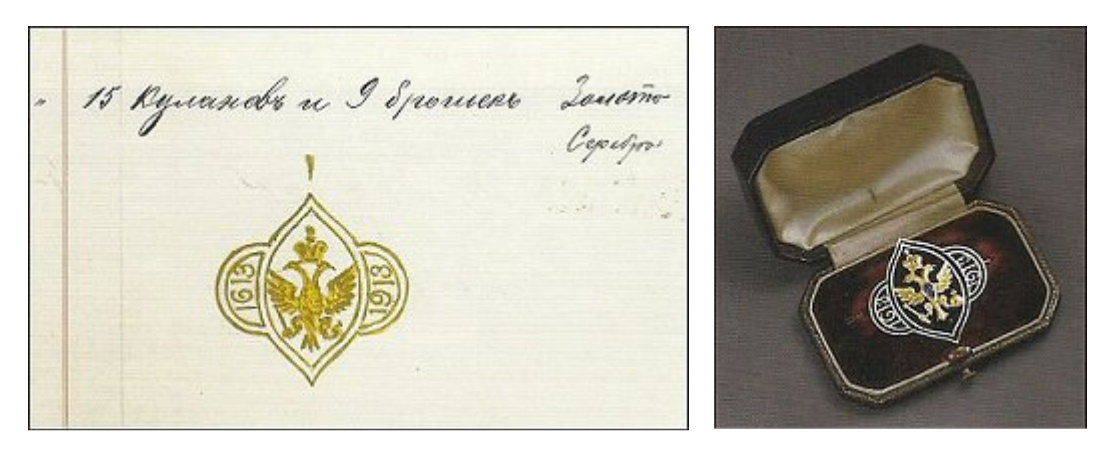
Holmström Design Sketch and Lozenge-shaped Brooch #3785 (Christie's New York, Russian Works of Art , October 17, 1996, Lot 89, $13,800)

Small gold and silver brooch "of lobed and square form", with a double-headed eagle encircled by rose-cut diamonds, diamond set corners, decorative scrolls, and the dates 1613 and 1913 is in The State Hermitage Museum, St. Petersburg, Russia. It is odd to have a green glass paste in the eagle's chest, suggesting the original stone was replaced. A similar design for this brooch with a red stone is in the Holmström albums.