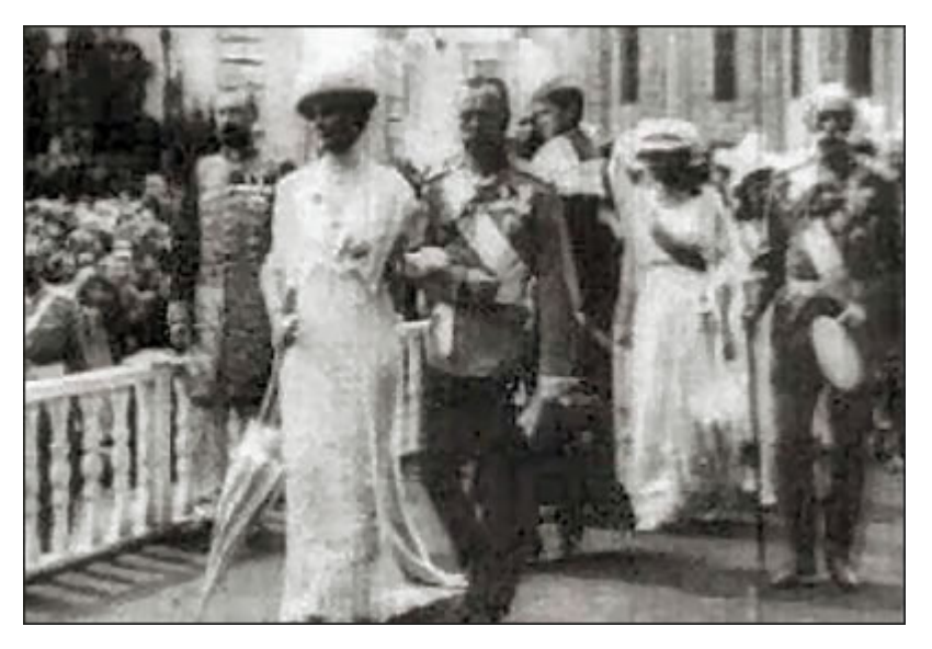
May 15, 1913 - Imperial Family at the Te Deum Service in Moscow

For these elaborate ceremonies, numerous souvenirs and keepsakes were commissioned: