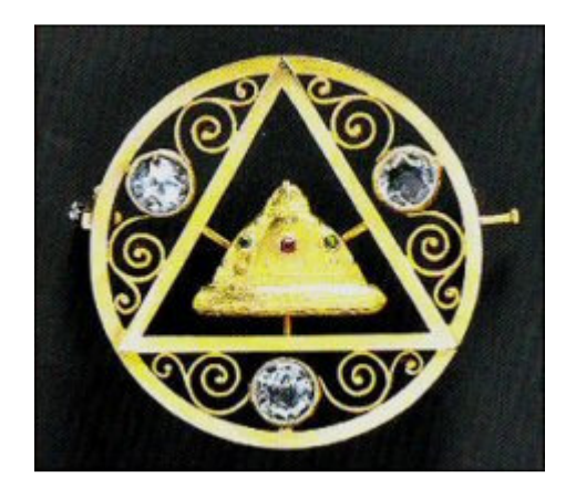
Holmström Aquamarine Brooch (Wartski, Fabergé and the Russian Jewellers , 2006, 47 and 60)

A design sketch (dated May 22, 1913) from the Holmström's design albums coincides with the dates of the tercentenary activities throughout Russia, but it does not have the 1613-1913 dates. The sketch denotes one brooch with aquamarines and two with amethysts were made. In the opinion of the author, the gold, circular brooch with three aquamarines housed in its original, blue leather Imperial presentation case may be the aquamarine pin.