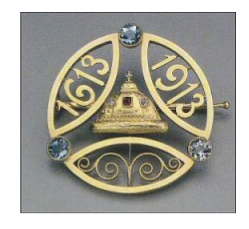
Aquamarine Tercentenary Brooch # 4595 (Odom, What Became of Peter's Dream? 2003, 40-41)